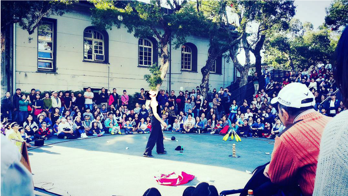
flat concrete floor