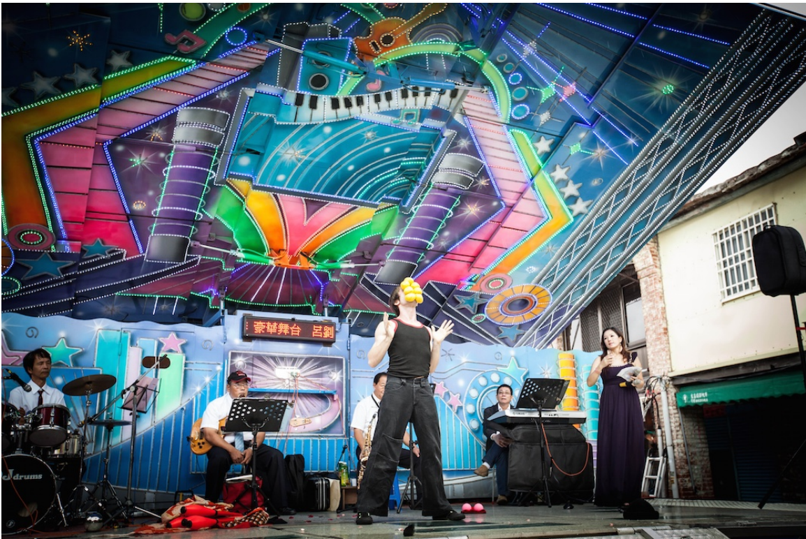
outdoor stage xtrem spacing